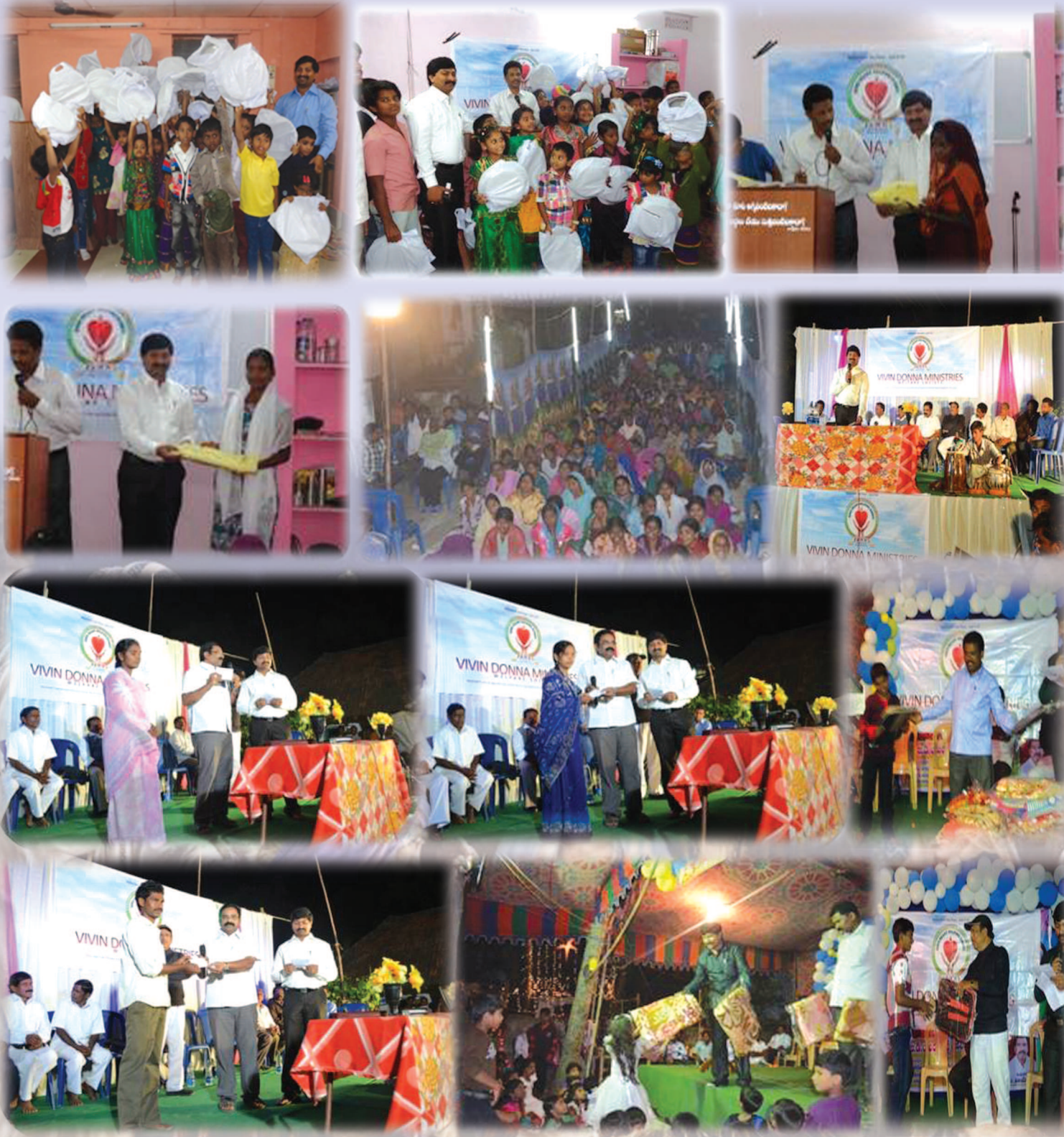
Photo Gallery 2013-14 Ministry Activities

H.No. 49-74/1/103, Neelima Residency, Cherukupally Colony, Chintal, Hyderabad -500 054, T.S., India.