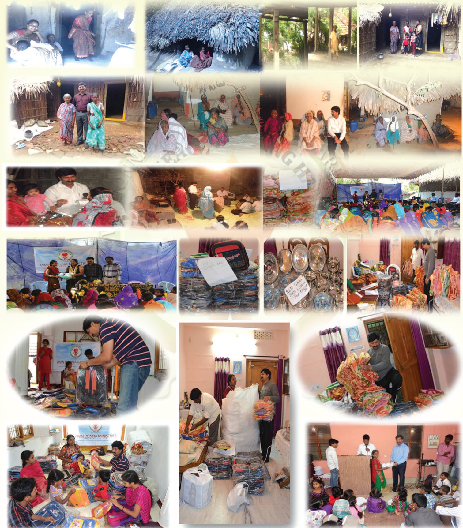
Photo Gallery 2013-14 Ministry Activities