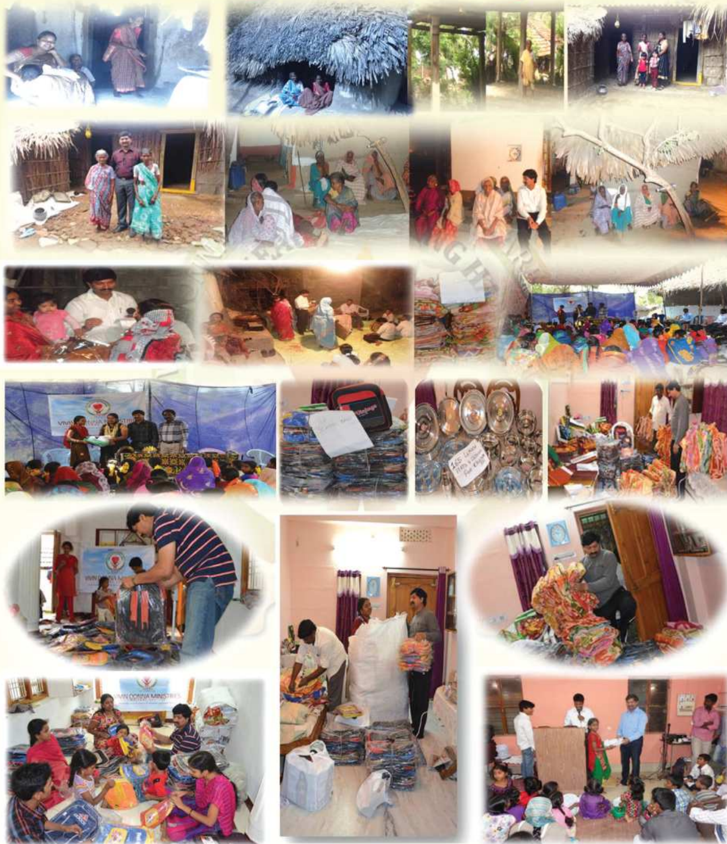
Photo Gallery 2013-14 Ministry Activities