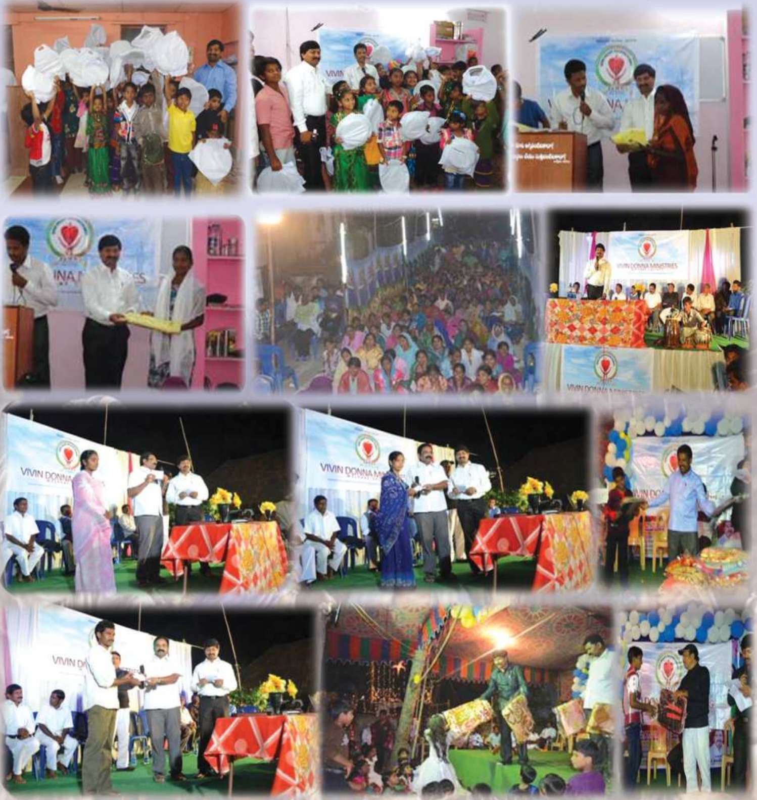
Photo Gallery 2013-14 Ministry Activities

H.No. 49-74/1/103, Neelima Residency, Cherukupally Colony, Chintal, Hyderabad -500 054, T.S., India.